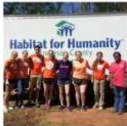
Habitat for Humanity Clemson University

The Clemson University chapter of Alpha Lambda Delta strives for academic excellence and promotes community service within Clemson and our surrounding communities. One way we enjoy giving back to others in the local community is by volunteering in Anderson, South Carolina, with Habitat for Humanity. At these events, members